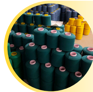
Dyeing (Thies, Germany)

This demonstrates our commitment to quality and the ability to handle large-scale-orders, as well as the flexibility to handle small batches from 50kg to 850kg.