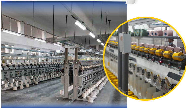
Winding (SSM Switzerland)